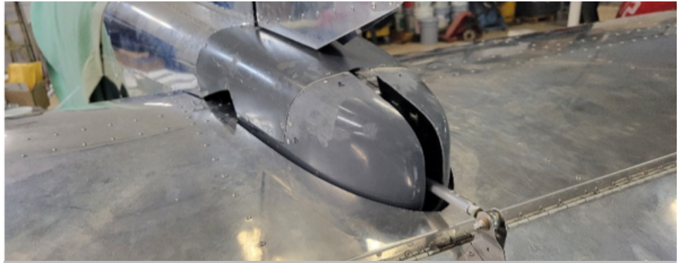
The completed Tailcone Fairing installed