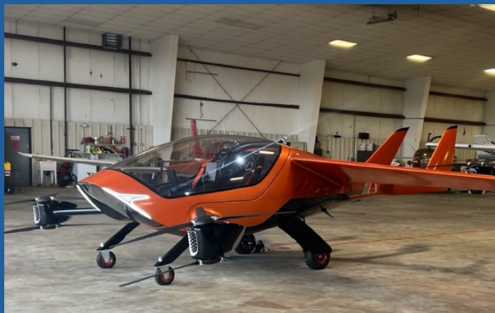
Autonomous Electric Uber at Hartford-Brainard Airport?