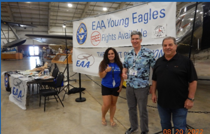
NEAM's Space and Education Day!