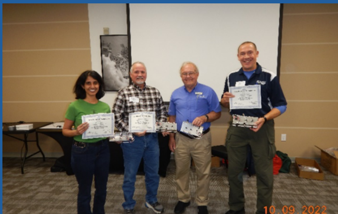
EAA SportAir Workshop at NEAM!