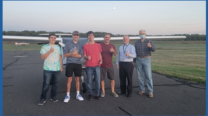
Will's Solo Judges!