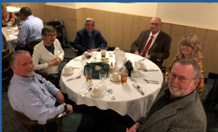
More 2022 awards dinner attendees!