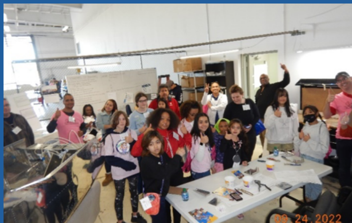
Girls in Aviation Day practice building an RV-12!