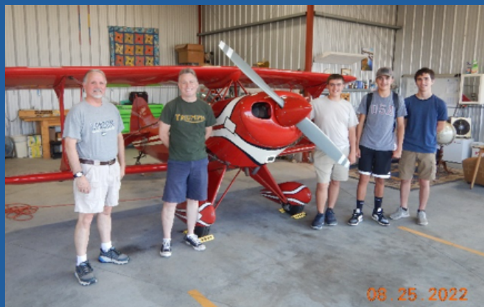
Whadda ya mean it only has ONE seat?