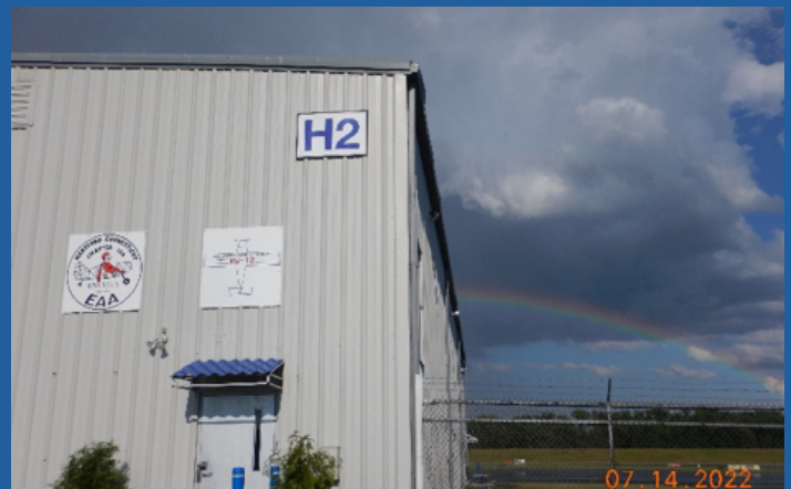
Another RV-12 build night with a rainbow!