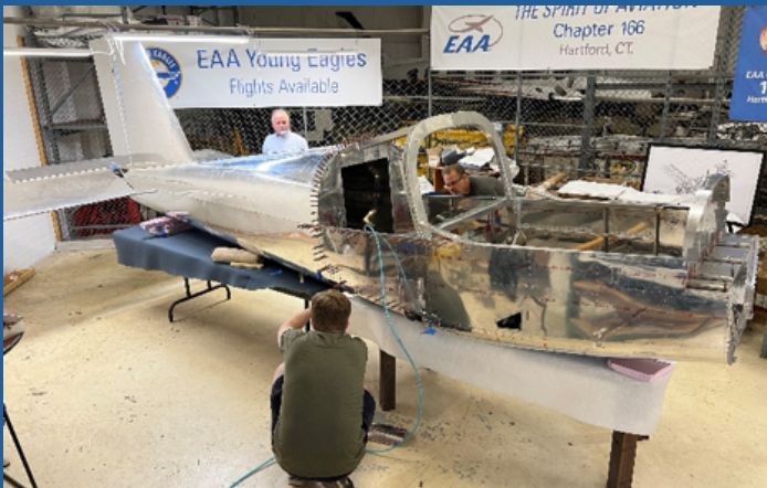
Our RV-12 coming together!