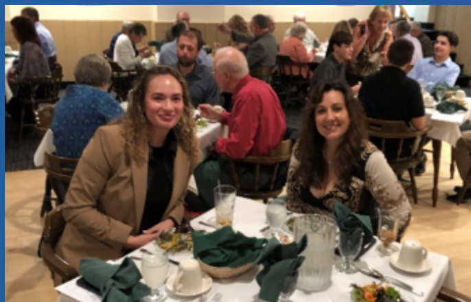
More future Pilots!