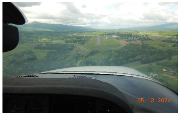
On final for Runway 4 at KLUA!