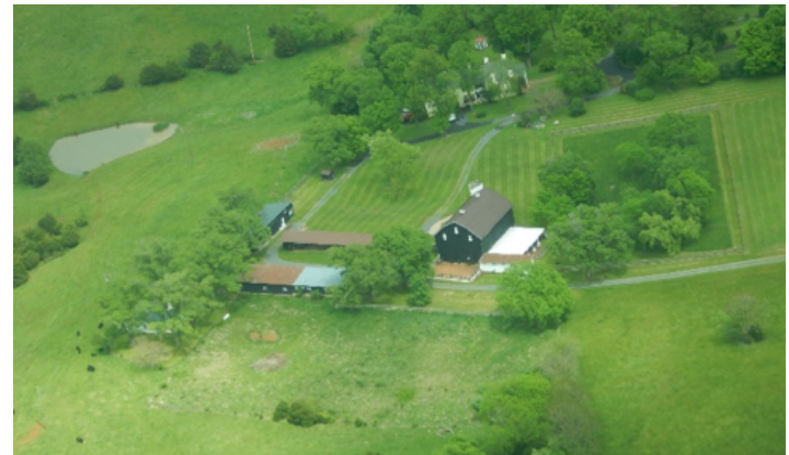
We found our target - the wedding venue!