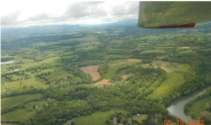
Flying in the Shenandoah Valley!