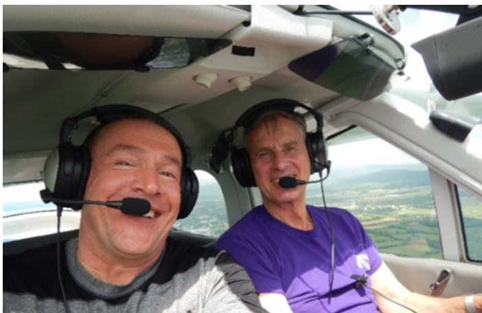
Who let these guys out?