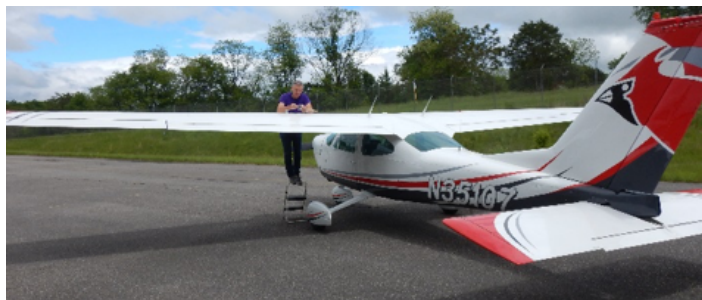
Getting ready to put the Cardnial back in its nest.