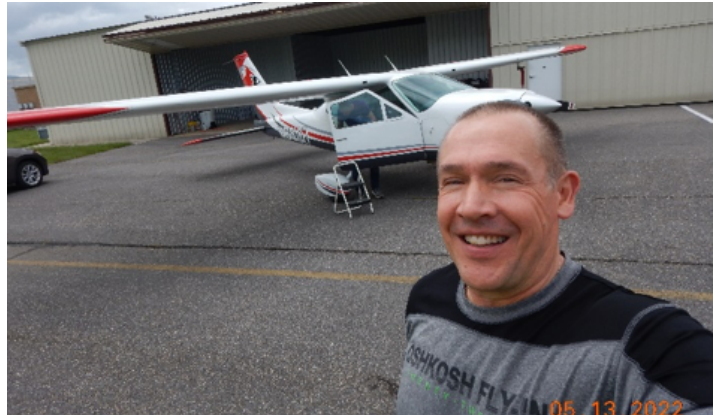
Getting the Cardinal ready!