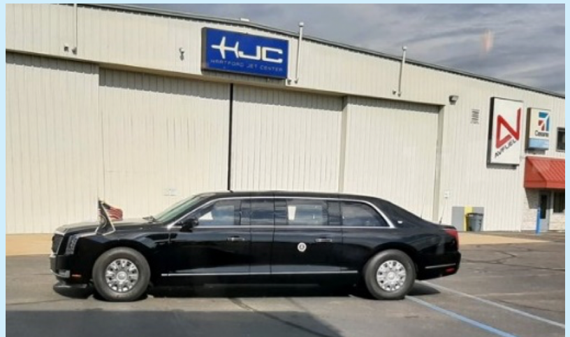
The "BEAST" at Brainard!