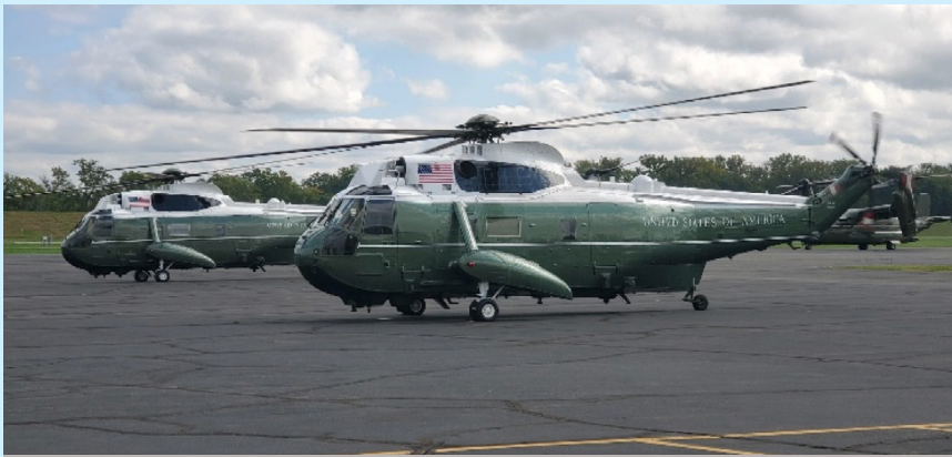
VH-34s used to transport President Biden with V-22s in the background on Friday, October 15.