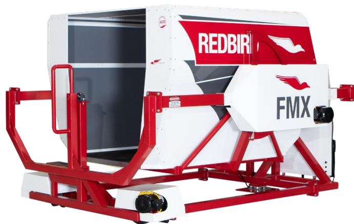
The Redbird at the New England Air Museum!