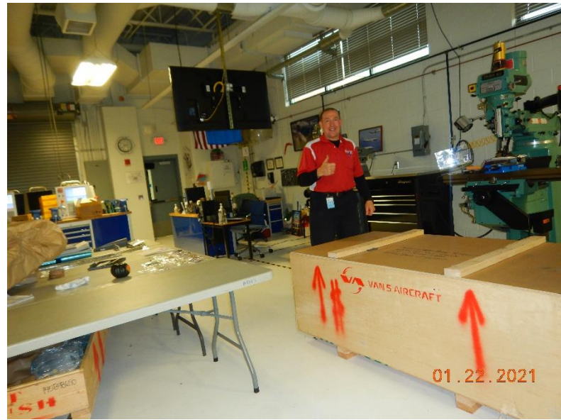
Middletown High School RV-12is Engine arrives!