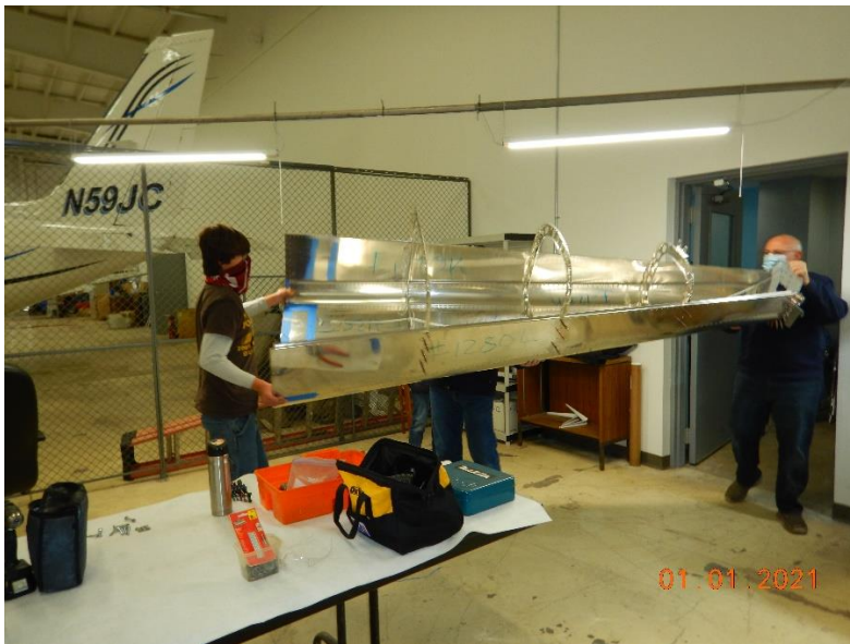
Now the Tail Cone!