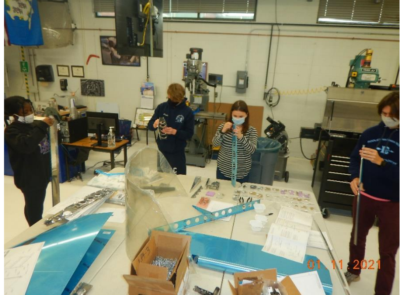
Middletown High School Students and EAA 166 Student Members building and RV-12is!