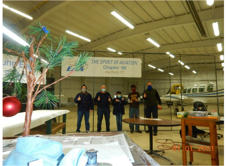
Awww! 166 Members with the Charlie Brown tree!