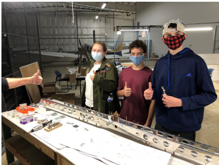
EAA 166 RV-12 under construction!