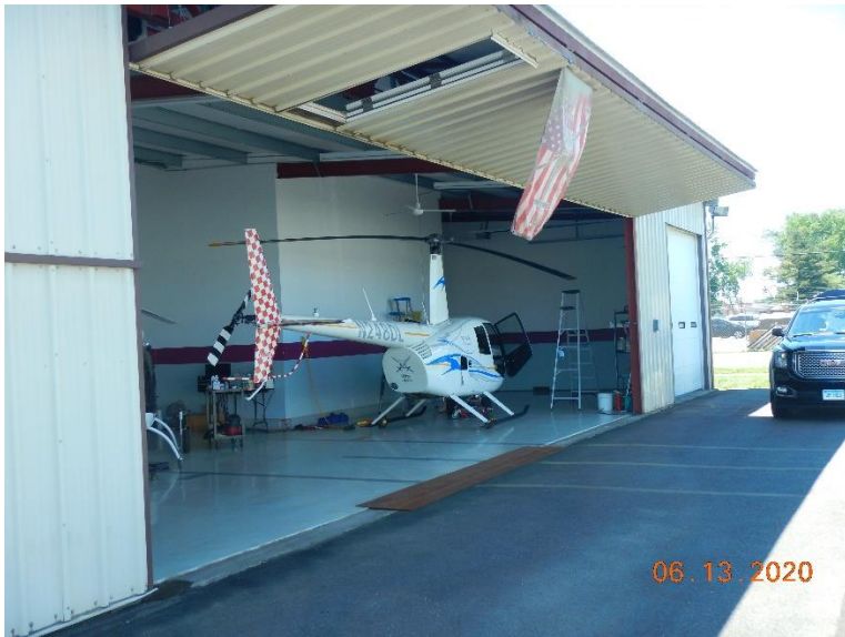
This is how you park a chopper!