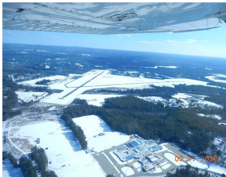
Ty's first time off of terra firma and now a YOUNG EAGLE!