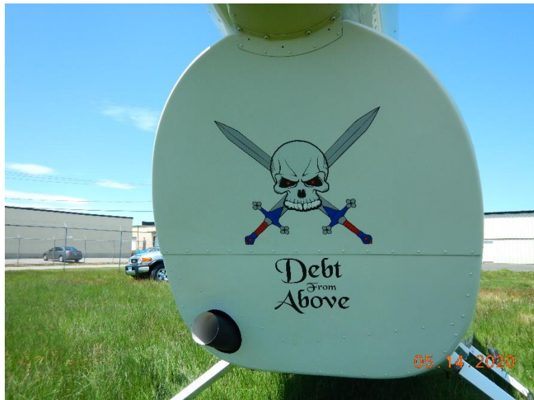
What debt? Choppers costa plenty? . . .but they sure are cool!