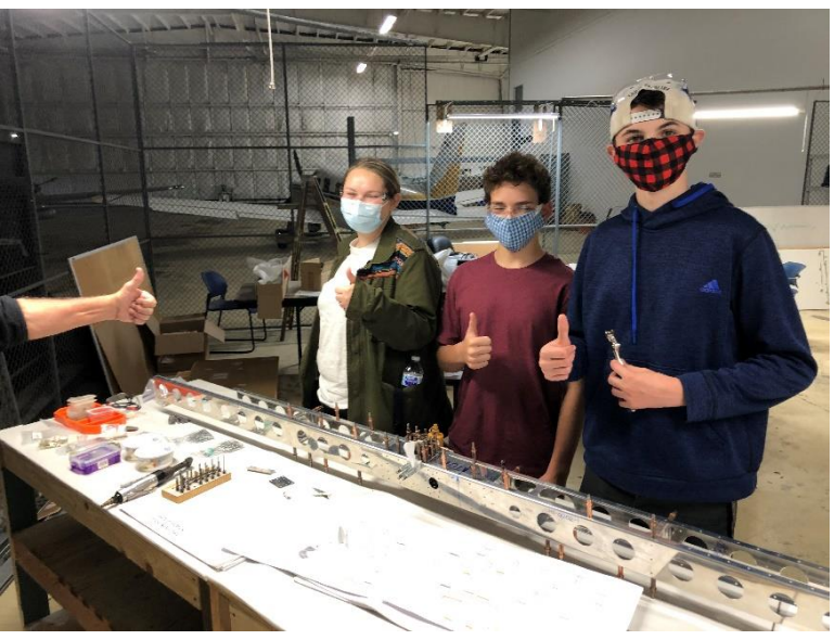
A few of our Student Members from Middletown High! (... and somebody's thumb!)