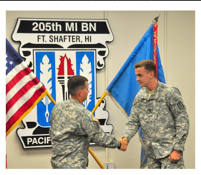
Thank you to ALL our Veterans!

If you would like to join EAA Chapter 166, please click on the link below.